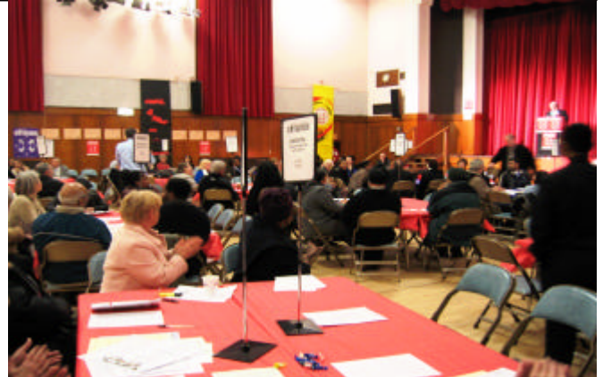
Delegates at the Assembly on 31st January 2006