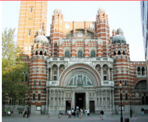
Westminster Cathedral Square where a spectacular rally on 1st May bringing all faiths and traditions together will take place.