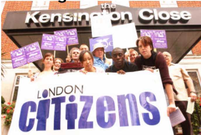
London Citizens Summer Academy students helped to raise the profile of employment practices at the Kensington Close